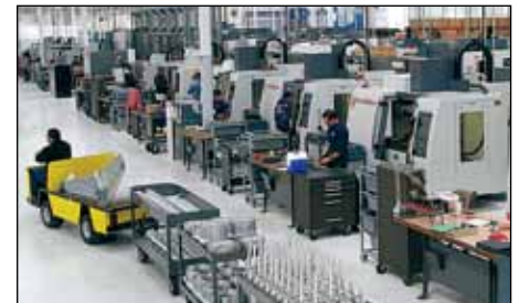
CNC machining centers