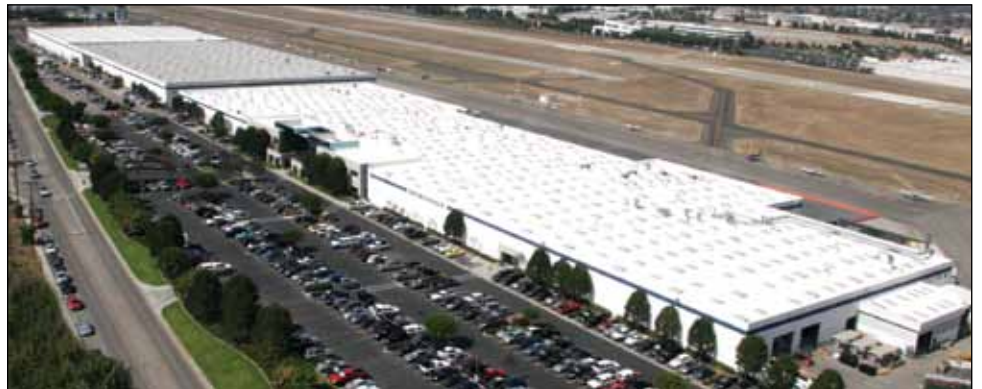
Robinson's 617,000 square foot facility.

To maximize efficiency and productivity, a large percentage of parts are manufactured in-house allowing the company to better control costs, eliminate delays and ensure the best possible quality.